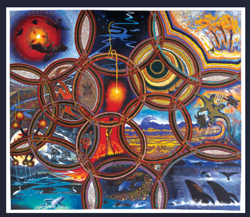
Ngallak Koort Boodja – Our Heart Land